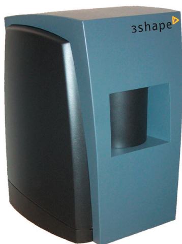
3Shape's ear impression 3D scanner accurately captures and processes full concha ear impressions

Our scanning system runs on standard Windows™-based PCs (included with the system) and requires no specific technical expertise to be operated.